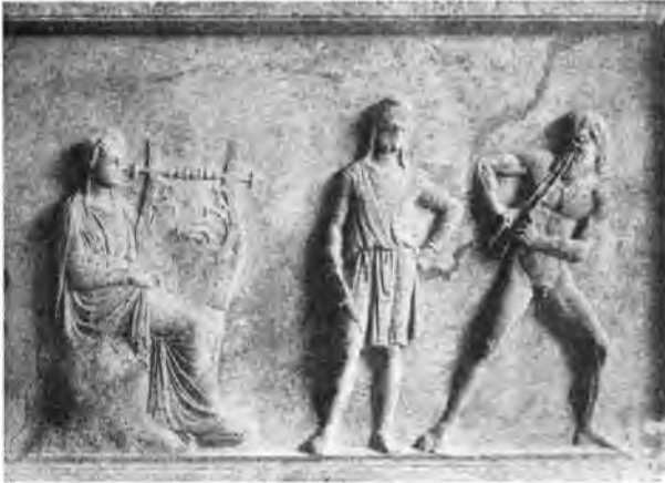
Fig. 56. Apollo and Marsyas.

The Sileni usually appear as the most repulsive and ludicrous of Dionysus' company. They have short, bloated bodies, and ugly, drunken faces;